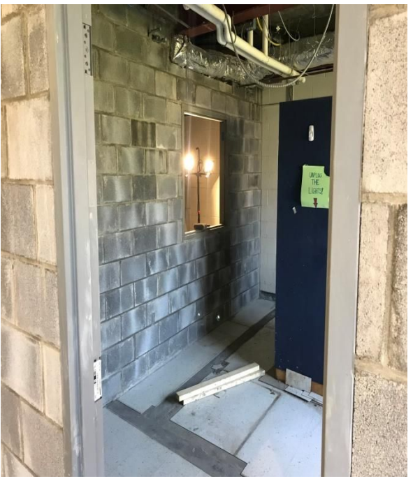
Demolition of Evans art and faculty rooms