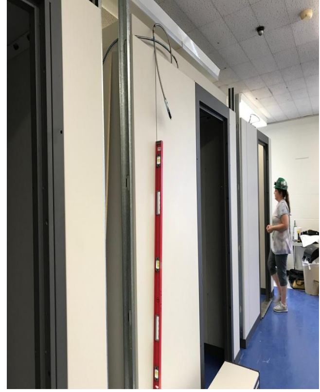
Sheafe Road's new security vestibule entrance Gayhead's defective sidewalk replacement