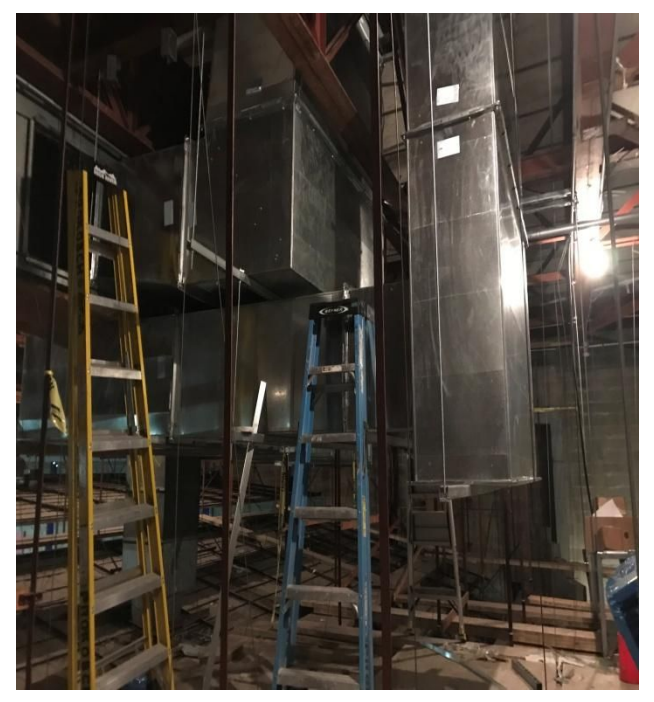
Evans asbestos abatement is now complete